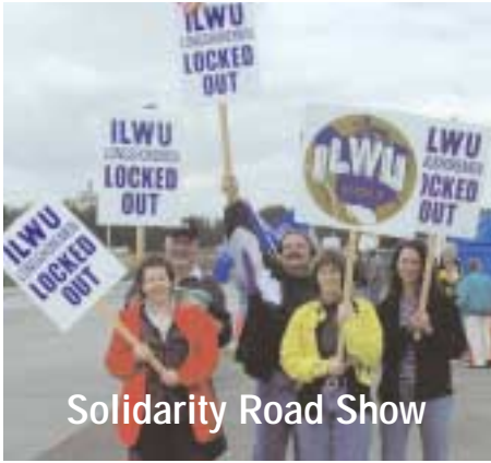
Solidarity Road Show

UAN/ONA nurses from Oregon Health & Sciences University, pictured above, used their feet and their voices to help some brothers and sisters in need during last year's dockworkers lockout on the West Coast. OHSU nurses have actively supported Portland-area labor struggles by visiting local picketing sites – especially since a 2001 nurses strike at OHSU, during which striking RNs were offered jobs by Longshoremen.